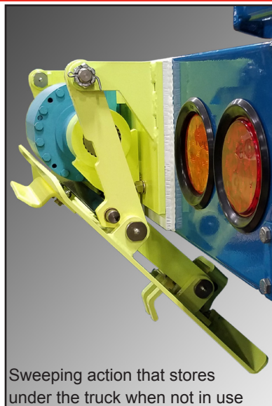
Sweeping action that stores under the truck when not in use