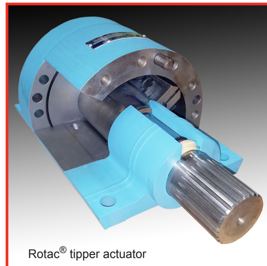
Rotac ® tipper actuator

Micromatic makes the only cart tipper using our Rotac ® rotary vane actuator One moving part means increased durability and easy service