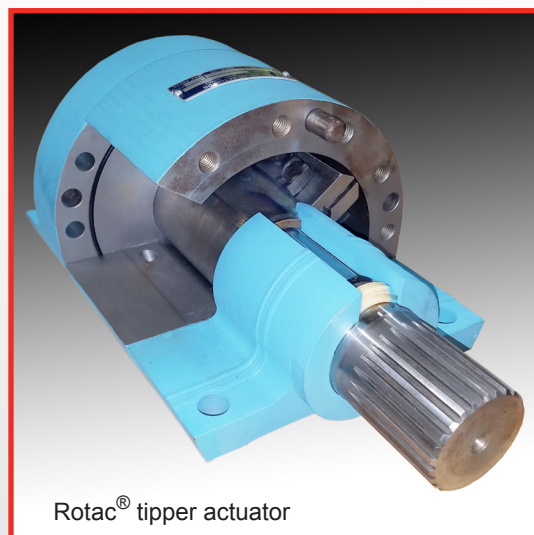
Rotac ® tipper actuator

Micromatic makes the only cart tipper using our Rotac ® rotary vane actuator One moving part means increased durability and easy service